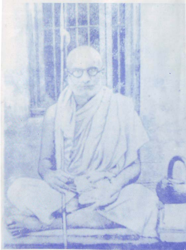
Photograph of Swami Ram Tirath ji, Dandi Sanyasi (Before entering Sikh fold)